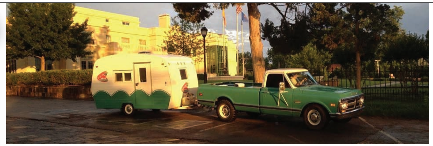
LICK MY LIPS FOOD TRAILER