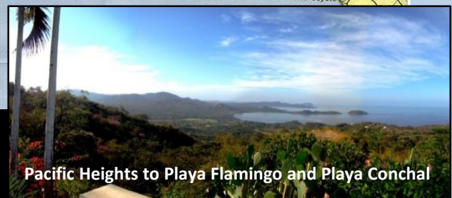
Pacific Heights to Playa Flamingo and Playa Conchal