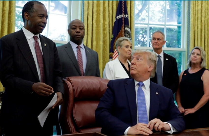
Executive Order on Housing Affordability