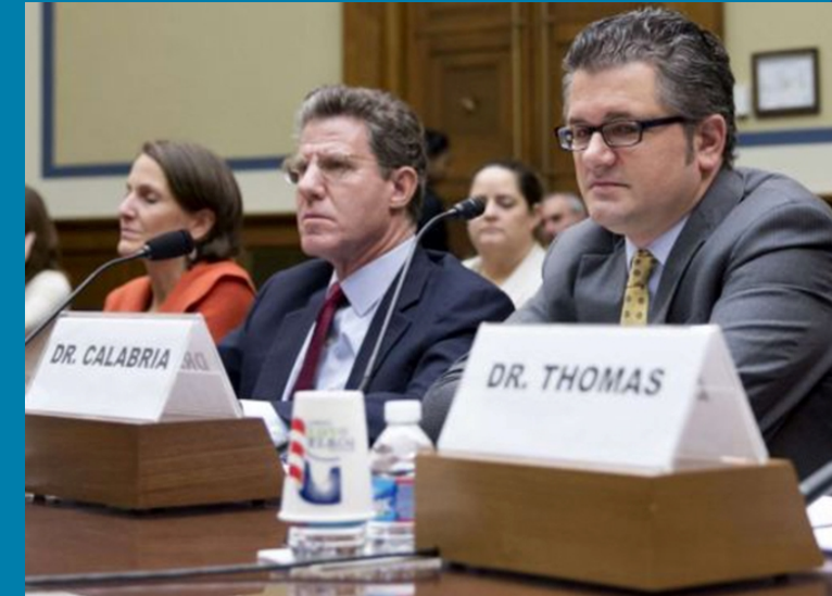
Support for Mark Calabria, FHFA Head