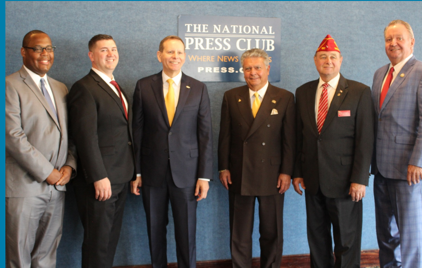
Celebrating the GI Bill and 24 Millionth VA Home Loan