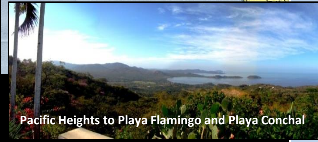
Pacific Heights to Playa Flamingo and Playa Conchal