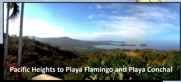
Pacific Heights to Playa Flamingo and Playa Conchal