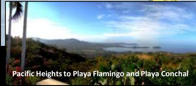
Pacific Heights to Playa Flamingo and Playa Conchal